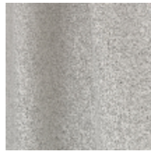
0795-22 DANDY M1 - GALET