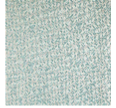
1483-06 SPLASH - ACQUA