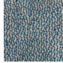
1483-05 SPLASH - OCEAN