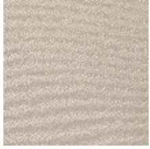
1483-01 SPLASH - NACRE