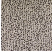
1483-03 SPLASH - GRANITE