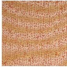
1483-09 SPLASH - PAPAYE