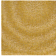
1483-08 SPLASH - SOLEIL