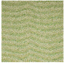
1483-07 SPLASH - PRINTEMPS