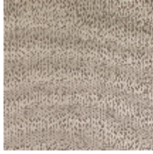
1483-02 SPLASH - NATUREL