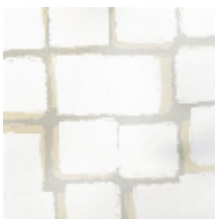
1486-01 PALETTES - NATUREL