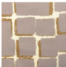
1486-02 PALETTES - TOURTERELLE