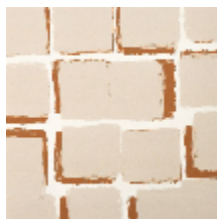
1486-03 PALETTES - POUDRE