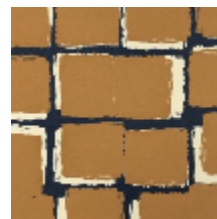
1486-05 PALETTES - CAMEL