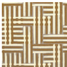
1487-02 NUANCES - TOURTERELLE