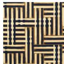
1487-05 NUANCES - CAMEL