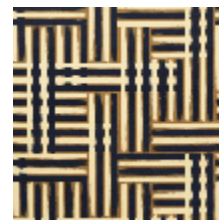
1487-05 NUANCES - CAMEL