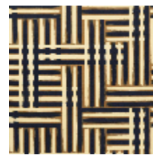
1487-05 NUANCES - CAMEL