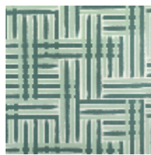
1487-04 NUANCES - CELADON