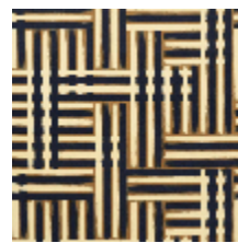
1487-05 NUANCES - CAMEL