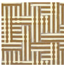
1487-02 NUANCES - TOURTERELLE