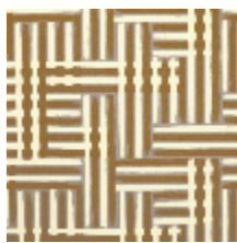
1487-02 NUANCES - TOURTERELLE