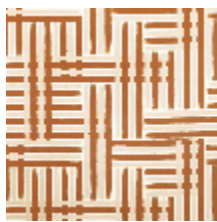
1487-03 NUANCES - POUDRE