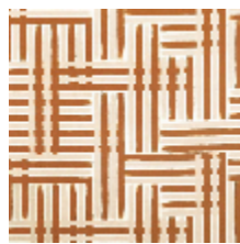
1487-03 NUANCES - POUDRE