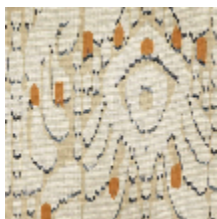
1488-01 IKATI - NATUREL