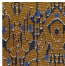
1488-04 IKATI - CAMEL