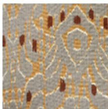
1488-02 IKATI - TOURTERELLE