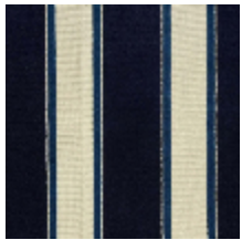
1489-07 GALERIE - MARINE