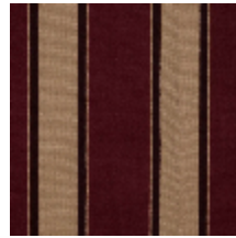
1489-05 GALERIE - GREMAT