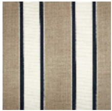
1489-01 GALERIE - NATUREL