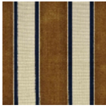
1489-02 GALERIE - CAMEL