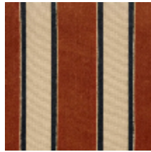
1489-04 GALERIE - TERRACOTTA