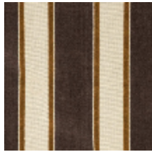
1489-03 GALERIE - TOURTERELLE