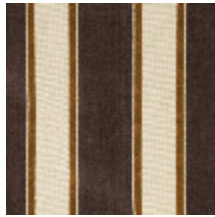
1489-03 GALERIE - TOURTERELLE