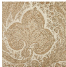
1512-03 KASHMIR - SABLE