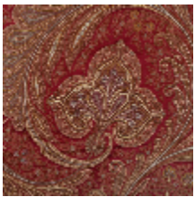
1512-01 KASHMIR - RUBIS