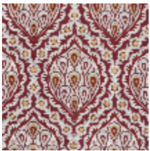
1560-01 LES GRENADES - CRAMOISI