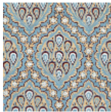
1560-03 LES GRENADES - SAPHIR