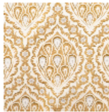
1560-04 LES GRENADES - DORE