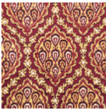
1560-02 LES GRENADES - GRENAT