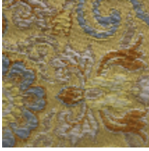
1665-02 GUIMET - OR