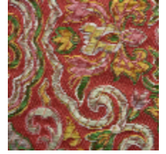
1665-06 GUIMET - ROUX