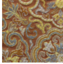
1665-04 GUIMET - BOIS