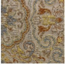
1665-01 GUIMET - IVOIRE