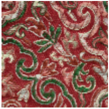
1665-07 GUIMET - RUBIS