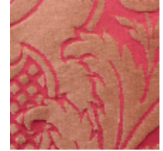
1668-07 GRAND DAUPHIN - ECARLATE