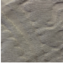
1668-01 GRAND DAUPHIN - IVOIRE