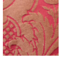
1668-07 GRAND DAUPHIN - ECARLATE