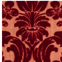
1681-04 MANSART - RUBIS