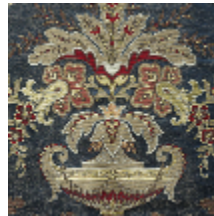
1683-04 VERDI - SAPHIR