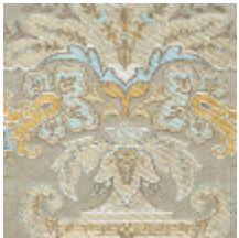
1683-01 VERDI - ARGENT