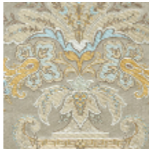
1683-01 VERDI - ARGENT