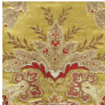
1683-02 VERDI - OR