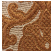
1691-04 LEONARDO - EAILLE