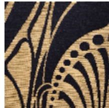
1694-05 VITRAIL - COUPOLE