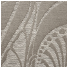
1694-02 VITRAIL - CHRYSLER