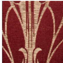
1694-04 VITRAIL - LAQUE