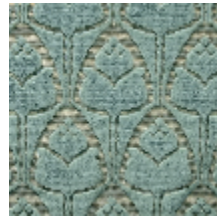
1695-05 TULIPES - PORCELAINE