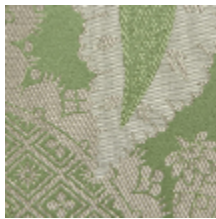
1697-02 PERSIENNE - AMANDE