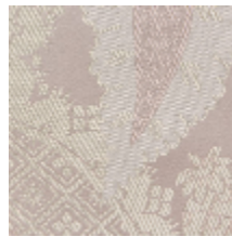
1697-04 PERSIENNE - POUDRE