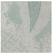
1697-01 PERSIENNE - OPALE