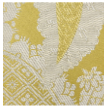
1697-03 PERSIENNE - OR