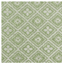
1698-02 CORSET - AMANDE