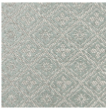
1698-01 CORSET - OPALE