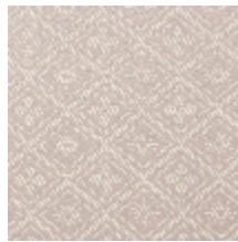
1698-04 CORSET - POUDRE