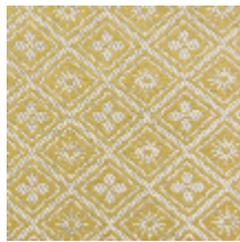
1698-03 CORSET - OR