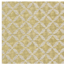
1699-03 GUIPURE - OR