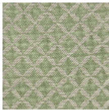
1699-02 GUIPURE - AMANDE