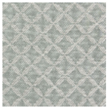
1699-01 GUIPURE - OPALE