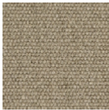
3212-02 SORBIER - LIN