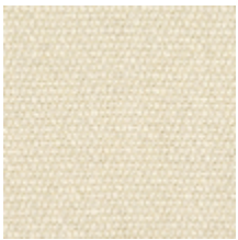
3212-01 SORBIER - ECRU