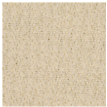
3216-01 FORSYTHIA - GRES