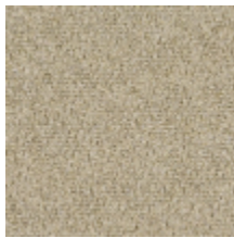
3216-02 FORSYTHIA - FICELLE