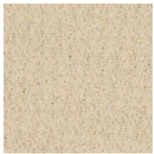
3216-01 FORSYTHIA - GRES