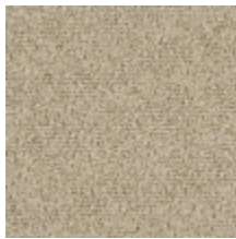
3216-02 FORSYTHIA - FICELLE