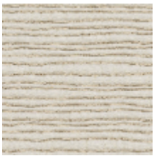
3219-01 GENEVRIER - GRES