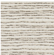
3219-02 GENEVRIER - BRUME