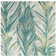
3224-01 PAMPAS - AGAVE