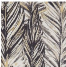
3224-02 PAMPAS - POIVRE