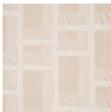
3227-01 DISTRICT - NATUREL