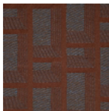
3227-03 DISTRICT - JASPE