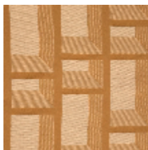
3227-02 DISTRICT - CAMEL