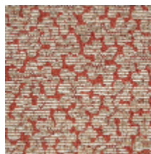
3237-04 CORAUX - SIENNE