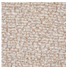
3237-01 CORAUX - NACRE