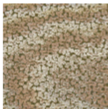
3237-03 CORAUX - KAKI