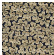
3237-05 CORAUX - NUIT