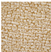
3237-02 CORAUX - OCRE