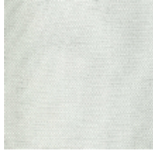
3245-03 SUMAC - GRES