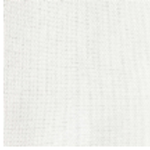
3245-02 SUMAC - ECRU