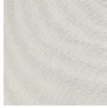
3245-04 SUMAC - DUNES