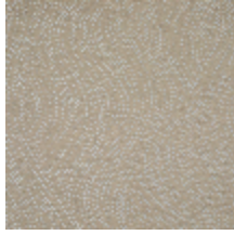
3250-02 CASCADE - BEIGE