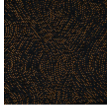
3250-04 CASCADE - BOISE