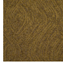
3250-05 CASCADE - BRONZE