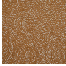
3250-03 CASCADE - GAZELLE