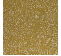
3250-06 CASCADE - GENTIANE