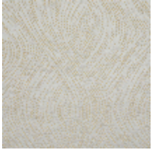
3250-01 CASCADE - NATUREL