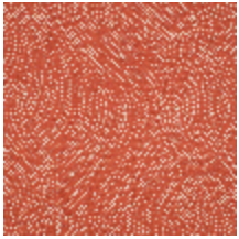
3250-07 CASCADE - PAPRIKA