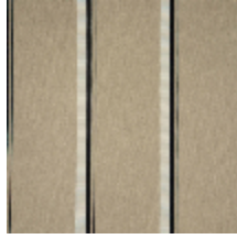
3251-03 ACACIA - MASTIC