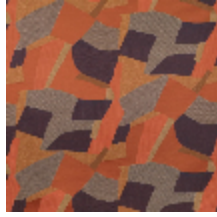
3260-03 HERITAGE - AUTOMNE