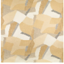
3260-01 HERITAGE - NATUREL