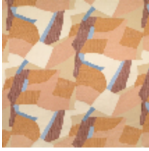
3260-02 HERITAGE - TERRACOTTA