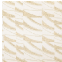
3261-03 DUNES - ECRU