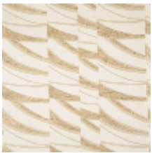
3261-01 DUNES - BEIGE