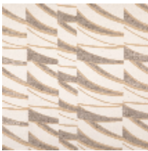
3261-02 DUNES - FICELLE