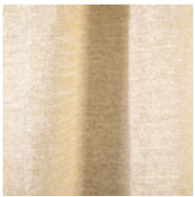
3262-01 DESERT - ECRU