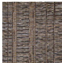
3263-04 SILLONS - MARINE