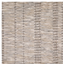
3263-03 SILLONS - GRIS