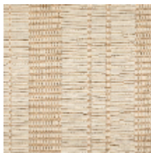
3263-02 SILLONS - ECRU