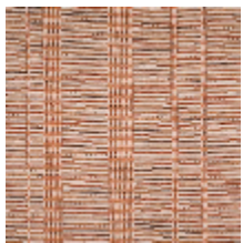
3263-01 SILLONS - TERRACOTTA