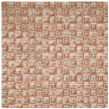
3264-01 NOMADE - TERACOTTA