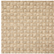
3264-02 NOMADE - BEIGE