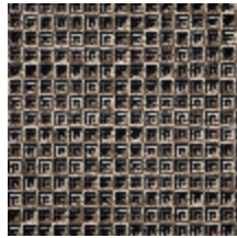
3264-04 NOMADE - MARINE