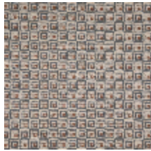
3264-03 NOMADE - GRIS BLEU