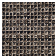
3264-04 NOMADE - MARINE