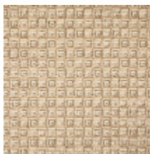
3264-02 NOMADE - BEIGE