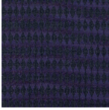
3266-02 LES ENCRES - LOSANGE