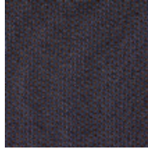
3266-04 LES ENCRES - CARRE