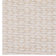
3268-05 LES CRAIES - DELTA