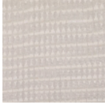
3268-02 LES CRAIES - LOSANGE