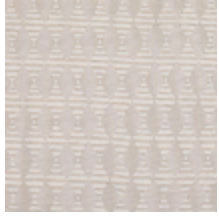
3268-01 LES CRAIES - BIG LOSANGE