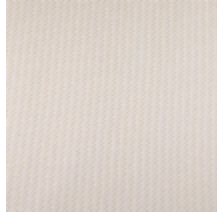
3268-03 LES CRAIES - CARRE