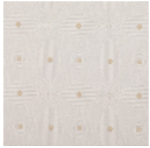
3268-07 LES CRAIES - BIG DEDALE