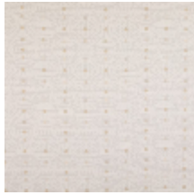
3268-08 LES CRAIES - BIG ESQUISSE