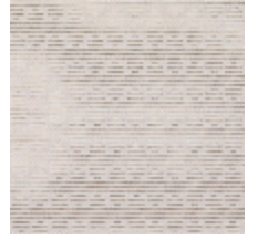
3268-06 LES CRAIES - RECTANGLE