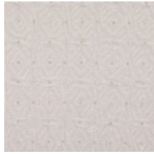
3268-09 LES CRAIES - DEDALE