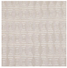
3268-01 LES CRAIES - BIG LOSANGE