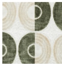
3280-04 EQUINOX - LICHEN