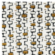
3281-02 ODORICO - MOUTARDE