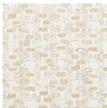
3281-01 ODORICO - NATUREL