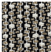
3281-03 ODORICO - CARBONE