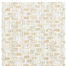
3281-01 ODORICO - NATUREL