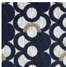
3283-02 MAELSTROM - MARINE