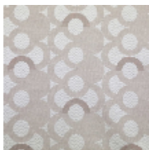
3283-01 MAELSTROM - NACRE