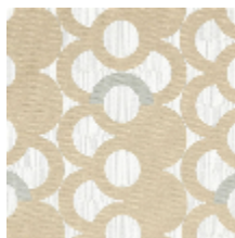
3283-03 MAELSTROM - DUNE