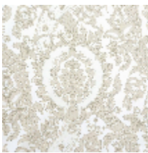
3284-02 LES INDES - NATUREL