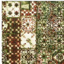
3304-03 PORTO - LAQUE *