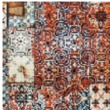
3304-02 PORTO - MANDARINE *