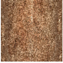
3326-01 PRECIEUX CUIVRE