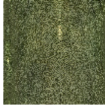
3326-04 PRECIEUX VERT