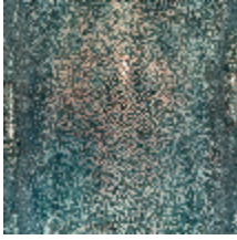
3326-02 PRECIEUX BLEU