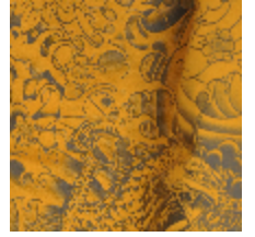
3433-06 KOMODO - GOLD