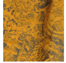
3433-06 KOMODO - GOLD